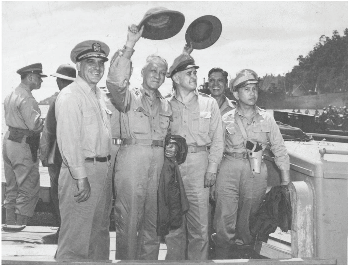
U.S. Navy officers with President Sergio Osmeña and Brigadier General Carlos P. Romulo